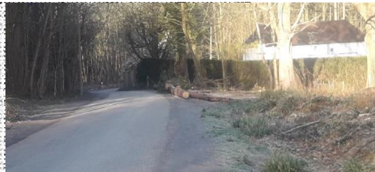
Photo 3. View of Forester's Cottage, with logs on right hand side