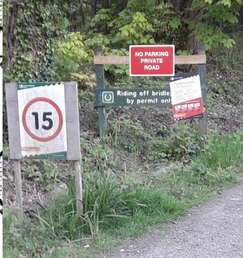
Photo 4. Signage westbound facing just past Forester's Cottage

Actions at Forester's Cottage 2019 Increased signage – failed 2020 Reduced parking at Forester's (during COVID-19 restrictions)