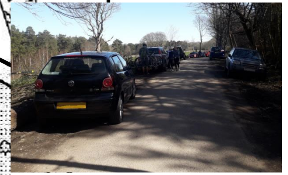
Photo 5. above Displaced parking Mar 2020 at Point 3. Photo 6. below New temporary gate Mar2020 at Point 3.

Actions at Eggshell Cottage Mar 2020 Temporary gate installed. Reduced parking at Point 1 and Point 2. Increased parking on highway towards Hawkurst Rd since. Extra signage and flyers being distributed Mar 2020 Liaising with councils on options