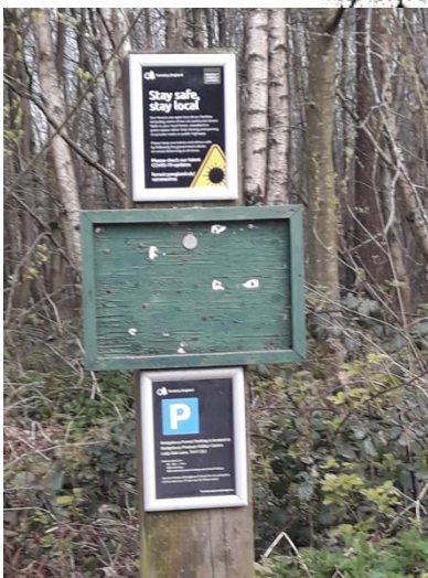
Photo 7. Parking bays signage at Point 1, removed May 2020.