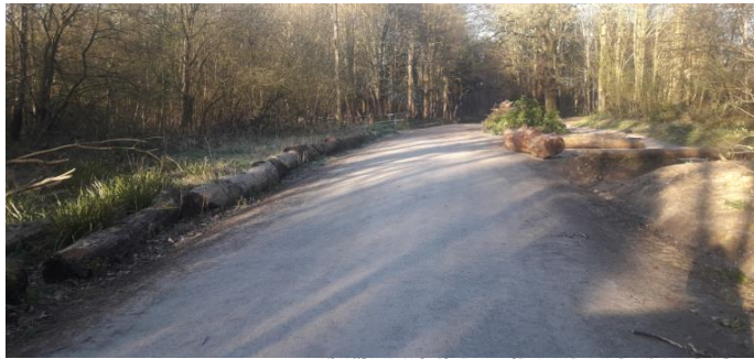
Photo 1. above View of Point 1. Parking bays on right hand side, access to Tanyard Farm on left. Mar 2020