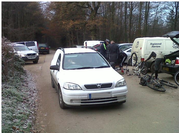
Photo 2. below Displaced parking in Jan/Feb 2011