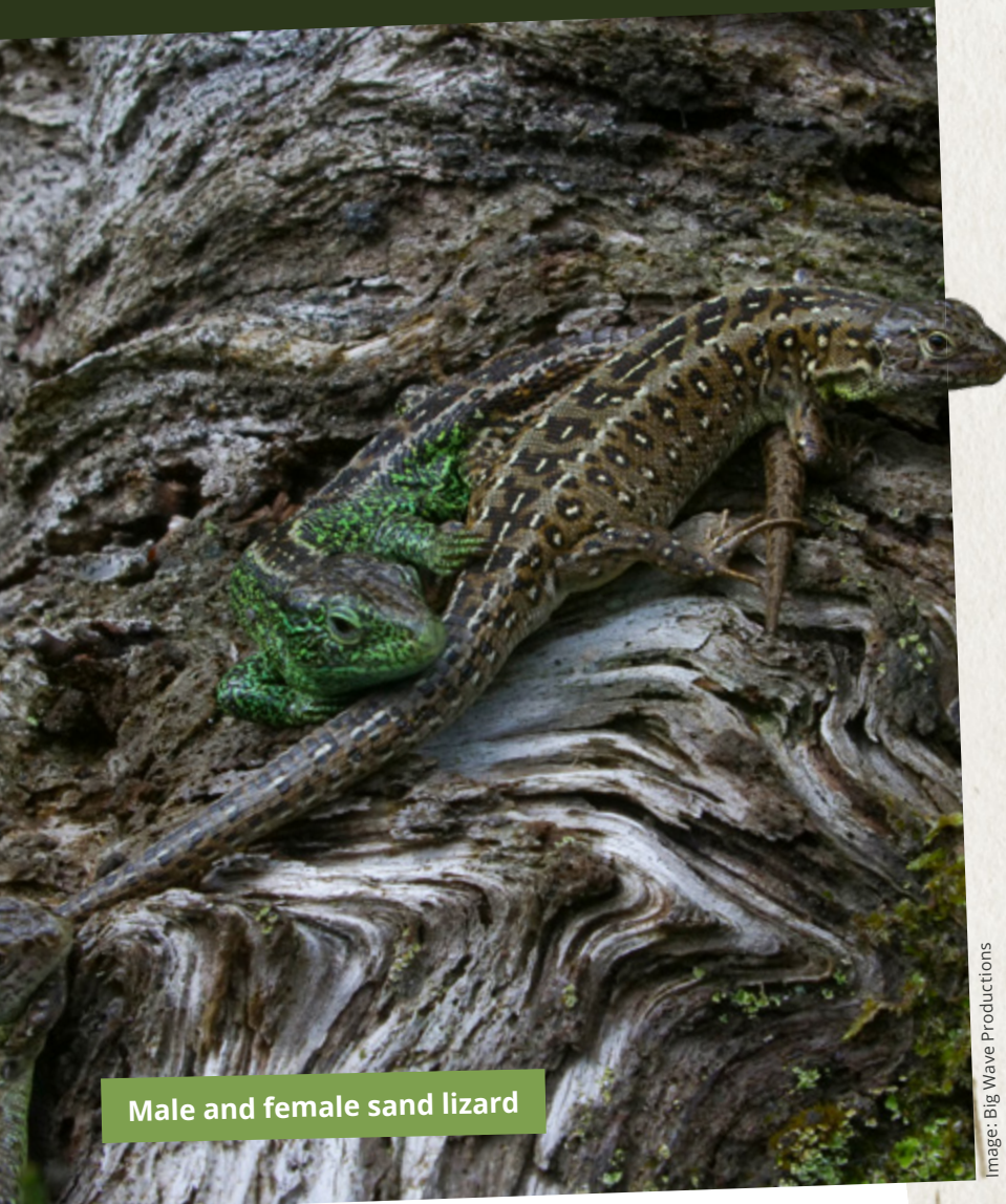
Male and female sand lizard

The New Forest Reptile Centre is managed in partnership with Amphibian and Reptile Conservation (ARC).