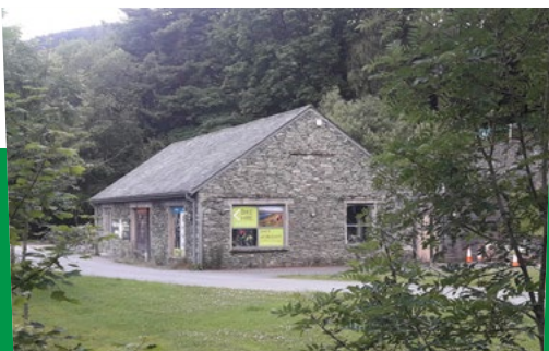
Grizedale Bike Hire building.