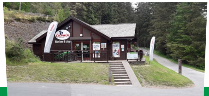
Whinlatter Bike Hire building.