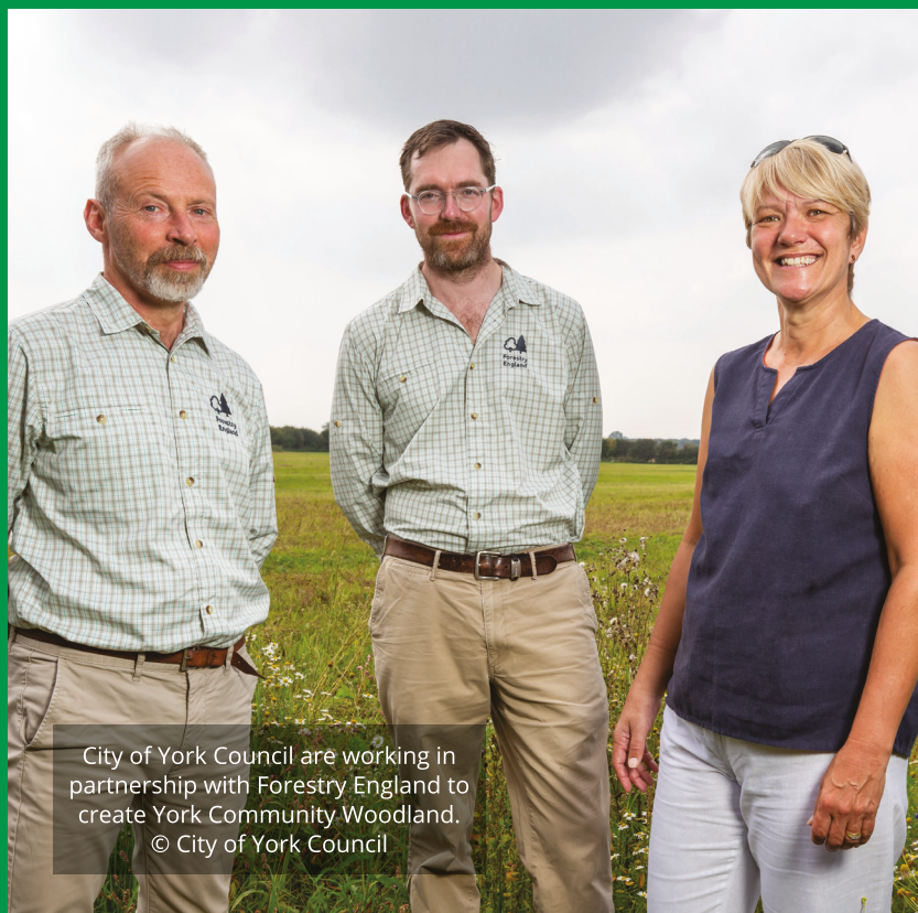
City of York Council are working in partnership with Forestry England to create York Community Woodland. © City of York Council

"York's Community Woodland is a flagship project in our plan to tackle the impacts of climate change. The 80-hectare woodland will provide green jobs, natural habitats for wildlife and freely accessible space for residents and visitors to enjoy. Forestry England have readily embraced the council's vision for the woodland and provide unmatched experience and expertise in its creation and management. Leasing the site to Forestry England ensures the capacity and skills needed for the project are secured for the long-term future of the woodland and significantly lowers any project risks for the council."