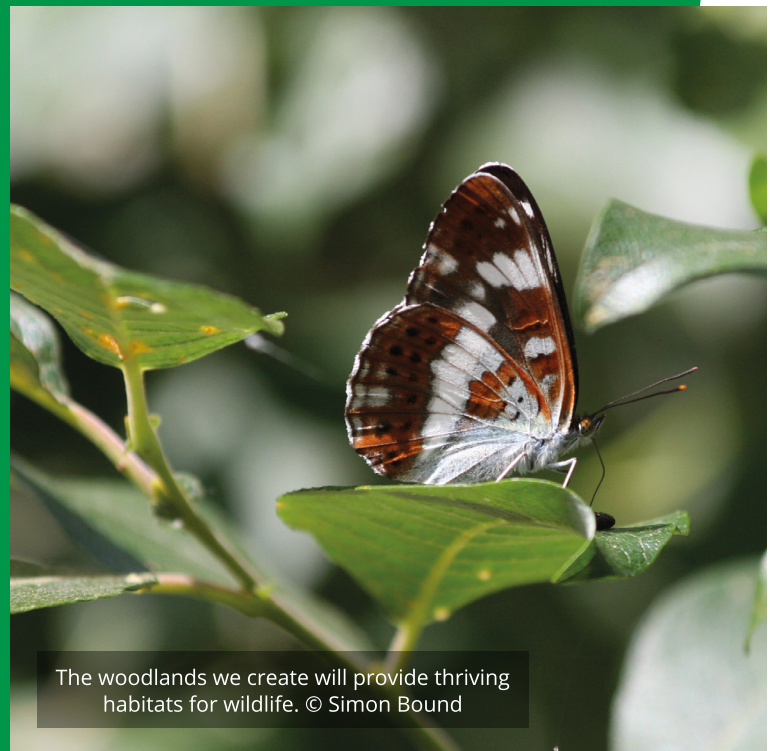
The woodlands we create will provide thriving habitats for wildlife.

If you're a new or established landowner, a farmer, a public body or a land agent acting on behalf of landowners, with a minimum of 20 hectares of land suitable for woodland creation, this scheme offers an opportunity to diversify your business and bring significant environmental and community benefits.