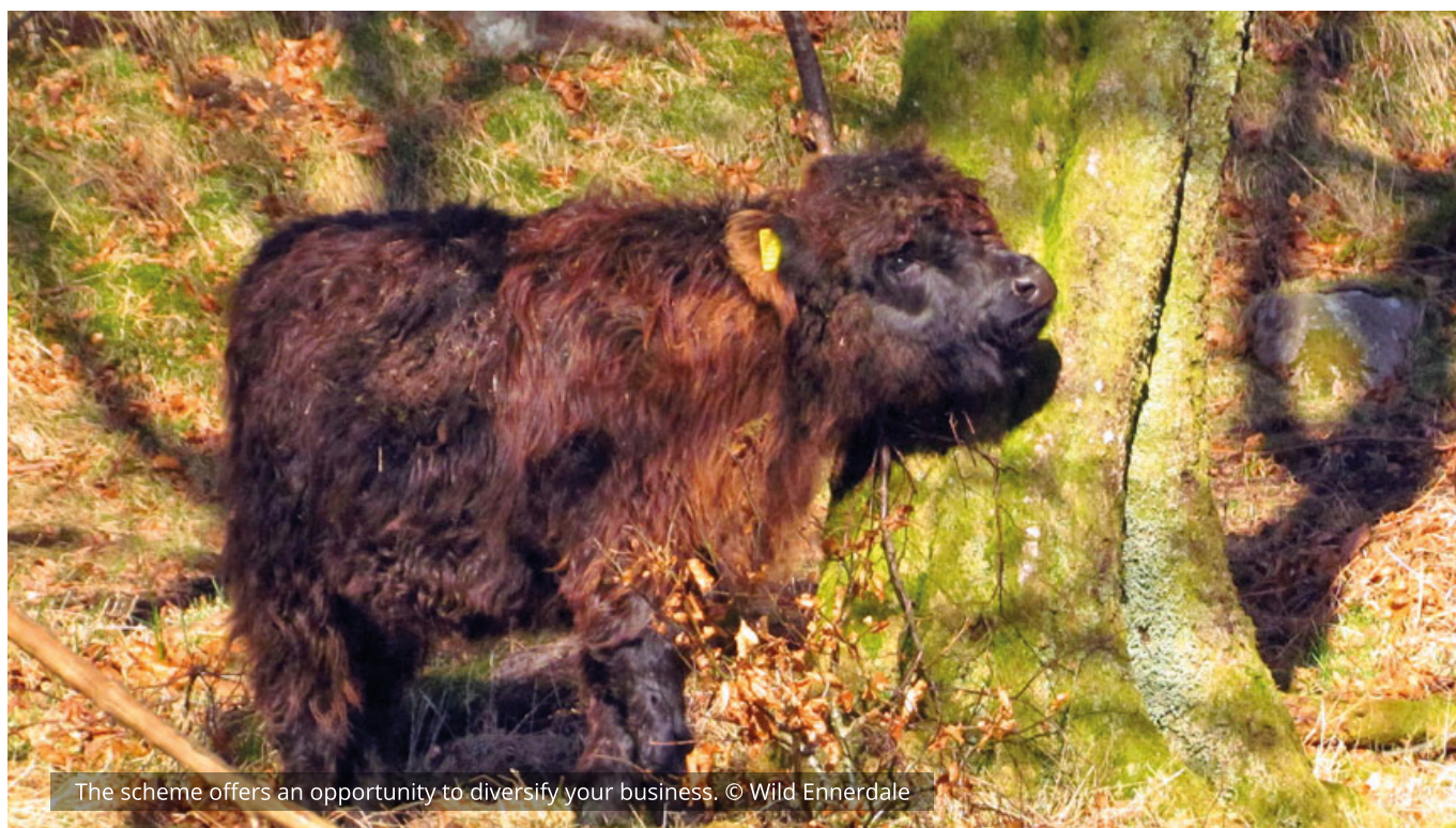
The scheme offers an opportunity to diversify your business.

www.gov.uk/guidance/create-woodland-overview