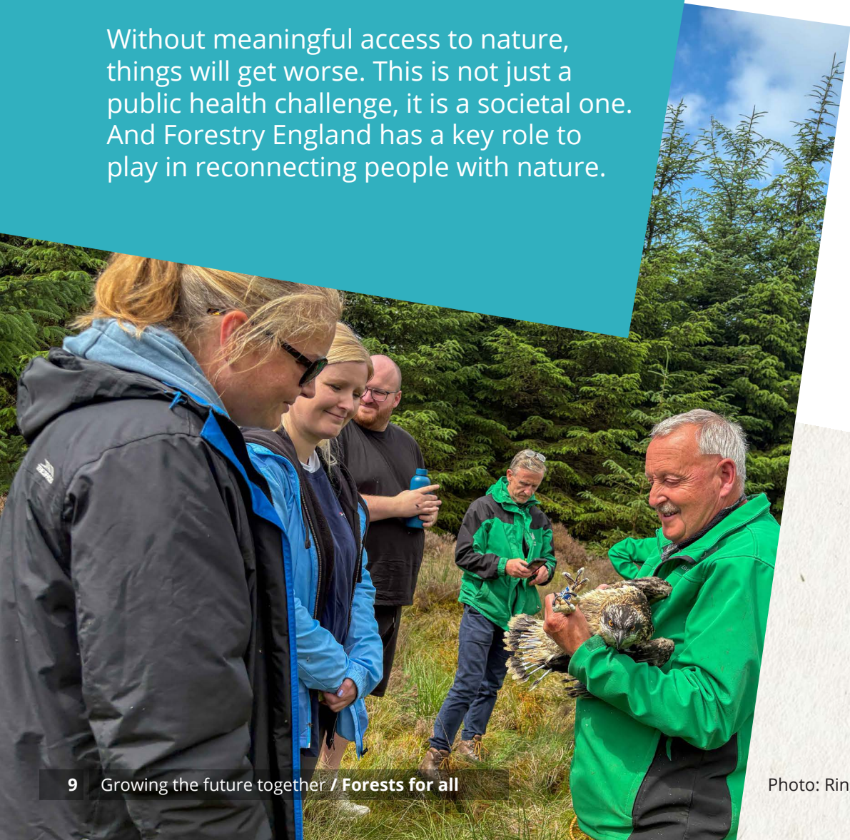
Photo: Ringing osprey at Kielder Forest with a team from British Airways.

By 2031, our volunteers will have delivered a further 1 million volunteer hours helping people connect with nature, care for forests and strengthen community resilience.