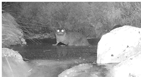
A recent picture of an otter at Hardknott Forest.