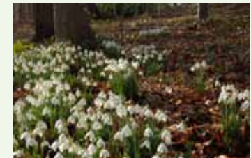
Top: Snowdrops at Santon Downham

Interesting information on the history and wildlife of this area can be found on eight panels around the walk. The walk can be started from St Helen's Picnic Site or Santon Downham. The easy access trail at St Helen's Picnic Site is one and a half miles long and follows the river for part of its route. It is suitable for wheelchairs and buggies.