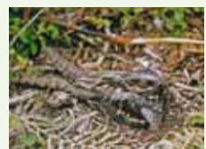
Right: Nightjar on nest