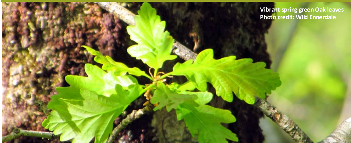
Vibrant spring green Oak leaves