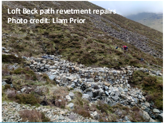
Loft Beck path revetment repairs

The National Trust West Lakes 'Fix the Fells' team plan to continue work at Loft Beck in the upper valley as part of improvement works for the Coast to Coast becoming a National Trail (funded by Natural England). The stone revetment is to repair a section of path that had been washed into Loft Beck, and stone pitching is required to improve a section of path above Loft Beck that is experiencing significant erosion, making the path difficult to walk on. The team have a few other sections to improve and will be up there over coming months. Once completed, the route should be in a sustainable condition that will be able to cope with the visitor impacts.