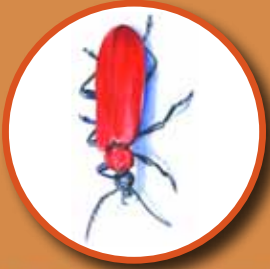
PREY Cardinal Beetle