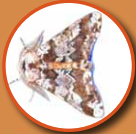
PREY Oak Beauty Moth