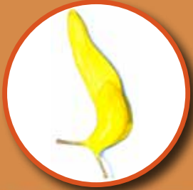
PREY Lemon Slug