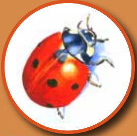
PREY 7 Spot Ladybird