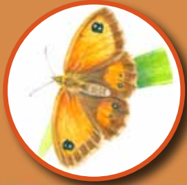
PREY Gatekeeper Butterfly