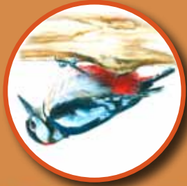
PREY Great Spotted Woodpecker