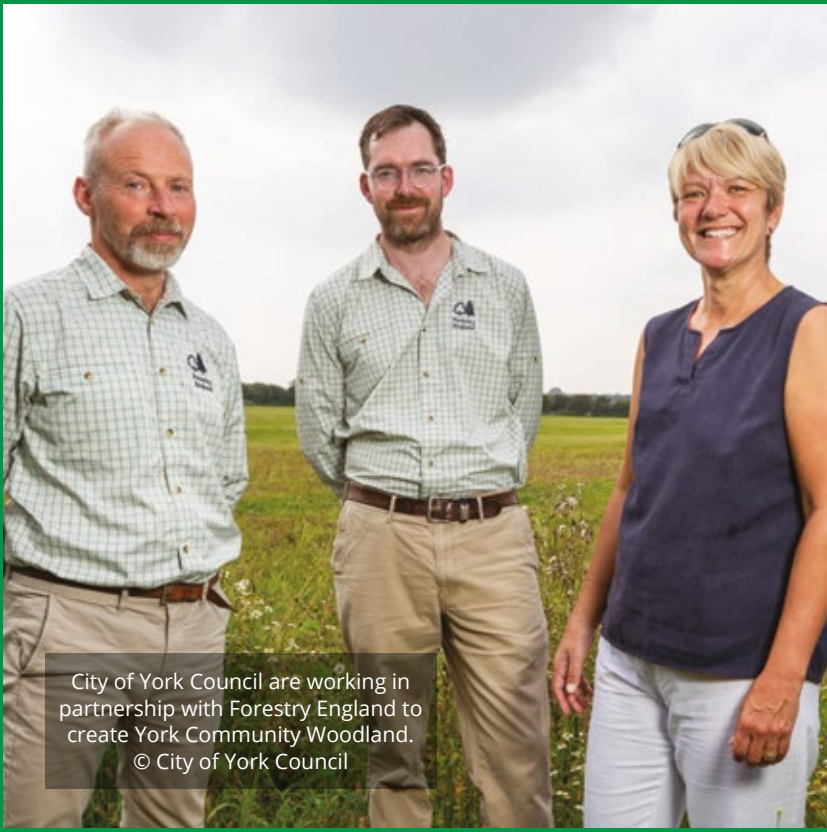
City of York Council are working in partnership with Forestry England to create York Community Woodland.

"York's Community Woodland is a flagship project in our plan to tackle the impacts of climate change. The 80-hectare woodland will provide green jobs, natural habitats for wildlife and freely accessible space for residents and visitors to enjoy. Forestry England have readily embraced the council's vision for the woodland and provide unmatched experience and expertise in its creation and management. Leasing the site to Forestry England ensures the capacity and skills needed for the project are secured for the long-term future of the woodland and significantly lowers any project risks for the council."