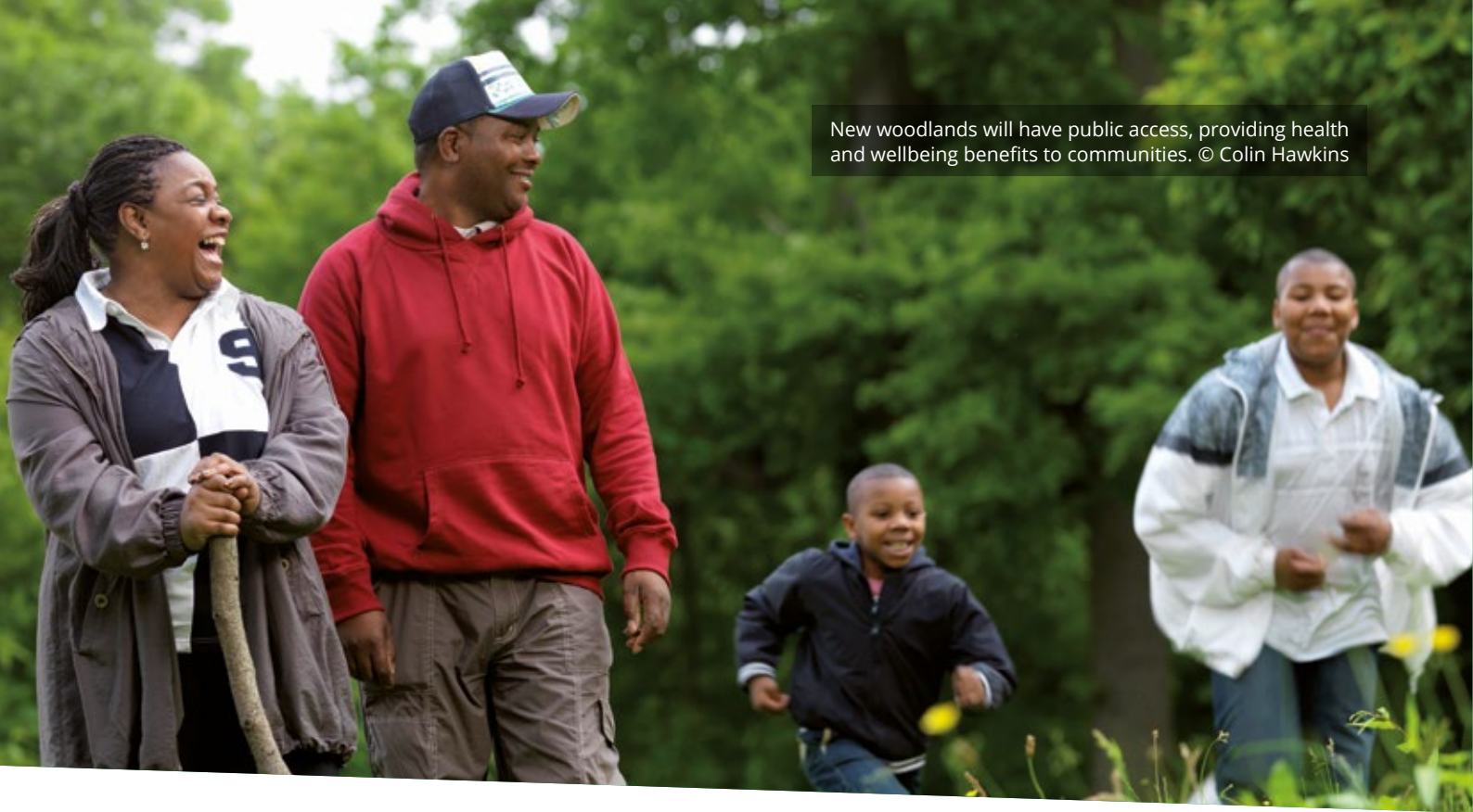
New woodlands will have public access, providing health and wellbeing benefits to communities.